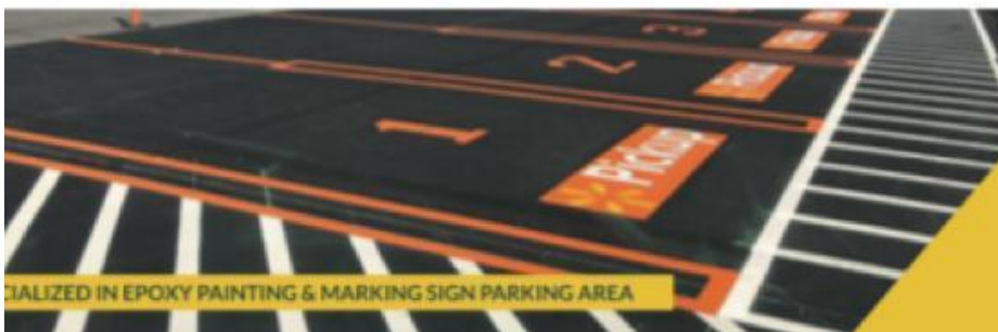
SPECIALIZED IN EPOXY PAINTING & MARKING SIGN PARKING AREA