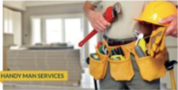
HANDY MAN SERVICES