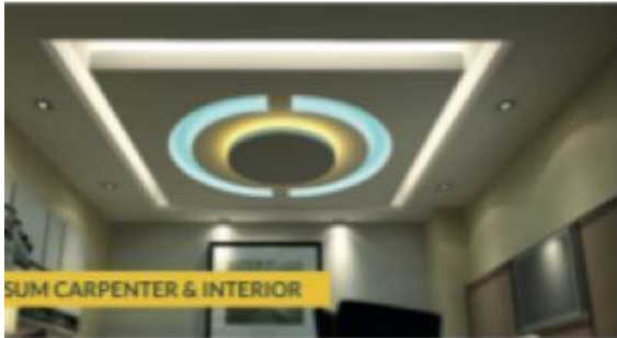
SUM CARPENTER & INTERIOR