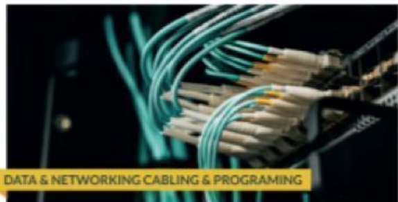
DATA & NETWORKING CABLING & PROGRAMING