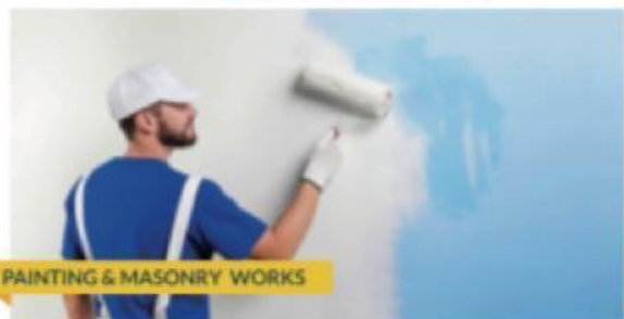
PAINTING & MASONRY WORKS