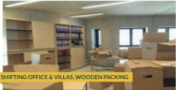
SHIFTING OFFICE & VILLAS, WOODEN PACKING