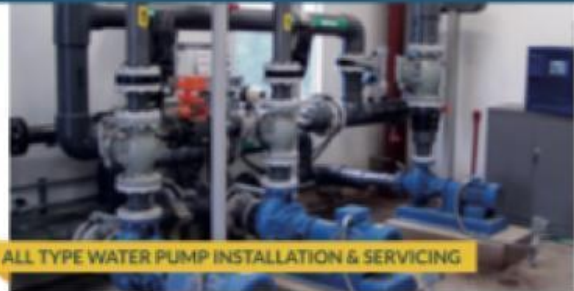
ALL TYPE WATER PUMP INSTALLATION & SERVICING