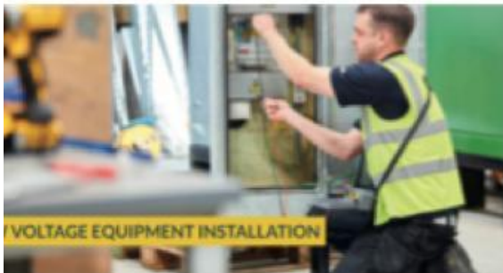
VOLTAGE EQUIPMENT INSTALLATION