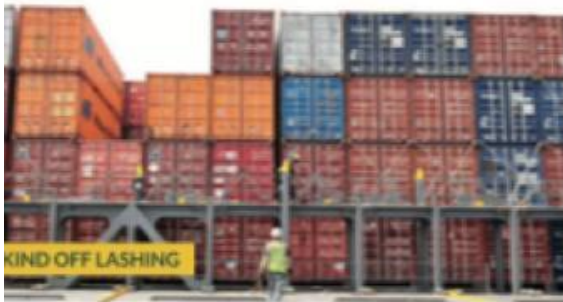
KIND OFF LASHING