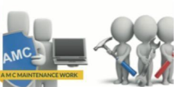
A M C MAINTENANCE WORK