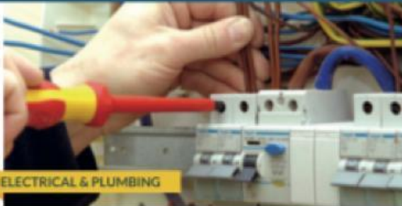
ELECTRICAL & PLUMBING